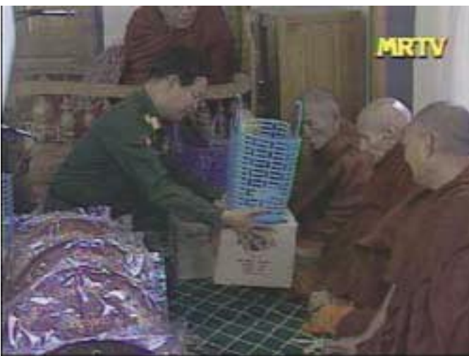
Below: A high-ranking government official brings a gift to the Buddhist monks who control the nation by an inordinate degree of influence over the military, which is the government of the country.

Myanmar, formerly Burma, is the land in which the famous pioneer Baptist missionary, Adoniram Judson, served. It is now governed by a military Junta that is extremely corrupt and oppressive.