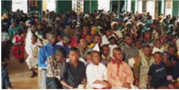
At the Ibadan “Come Ye Apart” Conference

Ibadan and in Ogbomoso, where the theme of the conferences was “The