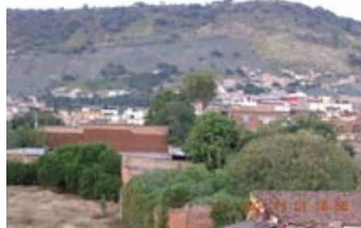
A view of Atotonilco from Steve's house

November 5 to 7 in Atotonilco we held a Bible Conference, the first conference that the congregation here has sponsored and one of the first of its kind in the Highlands. The conference far exceeded our expectations: