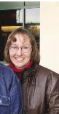
Cherry Skiles are from Ivory unrest there.

Cherry and I continue to appreciate your prayers for us and for those individuals who we minister with in West Africa.