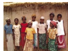
The young believer with A/X on her shirt is the one that died the week before I arrived.