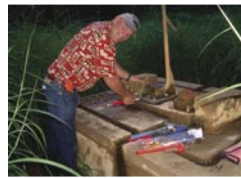
Making repairs on the village pump

I had several opportunities to visit and discuss with national Christians and expatriate missionaries the changes and challenges that are taking place in Africa. The lack of financial resources plagues the national Christian workers. Translation projects are stopped because there are no finances being given to the national translators. Some of the national translators refuse to move on without financial support. Mission hospitals, now operated by nationals, are without medicines because there are no funds to buy them. The hospital workers receive salaries, but few people use the hospital facilities because of lack of medicines. The hospital administration has extended credit to people coming for help, only to suffer from the good faith extended. This creates the financial burden of not being able to self-sustain