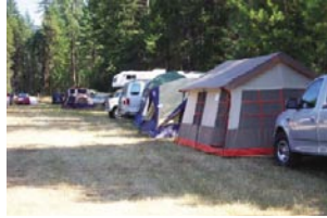
The facility was full. Some were housed in tents. No one cared, the fellowship was special.

As we gathered at Deer Lake for the Labor Day Believers Conference, saints came from Canada, Colorado, Montana, Wyoming, Texas, Oregon and all over Washington. With gas prices so high, it was a stretching time for many. Some of the young people so desired to be there, that they helped pay the way so their families could attend. Some gave the money from selling their 4H livestock at local fairs.